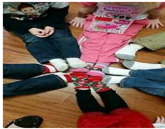
We have been celebrating Read Across America this week! Our students have enjoyed Crazy Hair Day, Backwards Day, Silly Sock Day, Green Eggs and Ham, and a special reading by the Cat in the Hat!