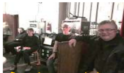
Part of our great backstage crew!