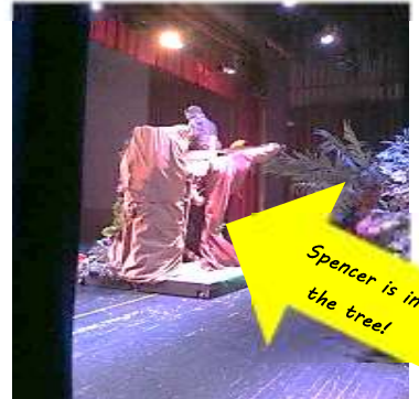
Spencer is in the tree!