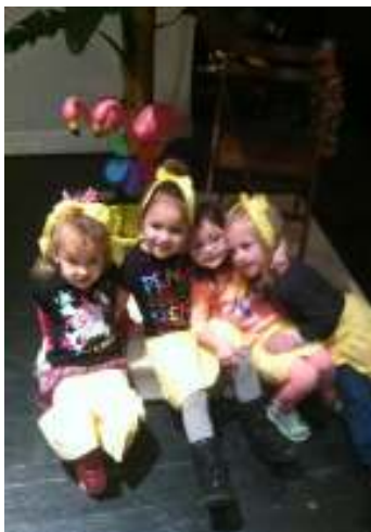
Our Pre-K students stole the show!